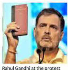
Rahul Gandhi at the protest rally in Freedom Park in Bengaluru on Friday

He added that the investigation in Karnataka, where his party's internal surveys predicted 15-16 seats but won only nine, took six months to uncover systematic vote theft in the Mahadevapura constituency alone. There, he alleged that 1,00,250 votes were stolen from a total of 6,50,000 — representing one in every six votes.